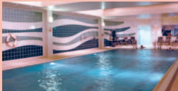
▲ Swimming pool at the Heathrow Marriott – heated by CHP