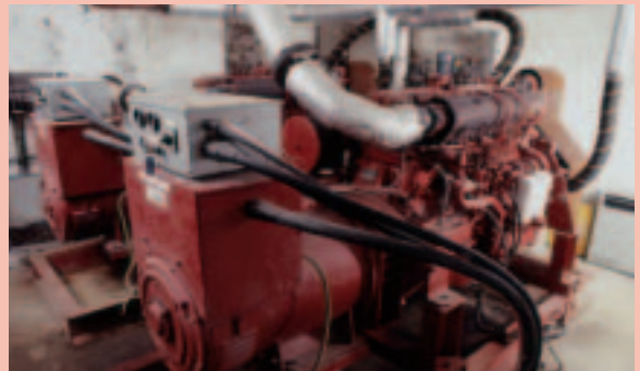
▼ Craning in the CHP equipment, August 2001