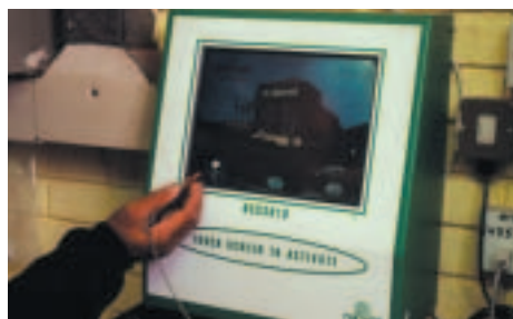
▼ The Building Energy Management System (BEMS) touch screen interface