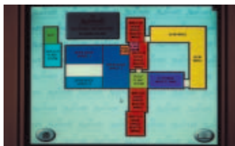
▼ The BEMS interface showing a schematic of the floor plan