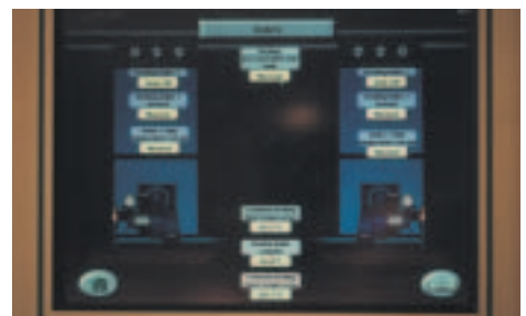
▼ The BEMS interface showing operation of conventional boilers