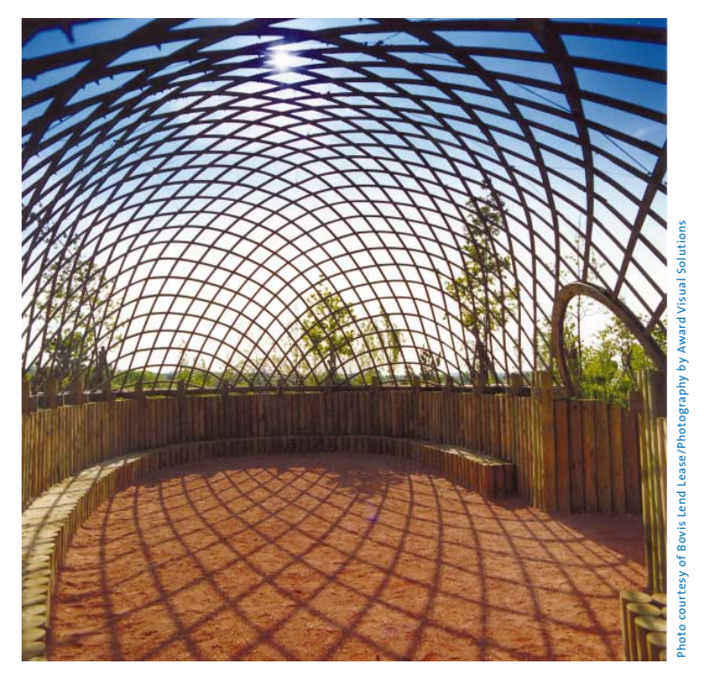
The Earth Centre, Doncaster, constructed by Bovis Lend Lease, one of the project collaborators